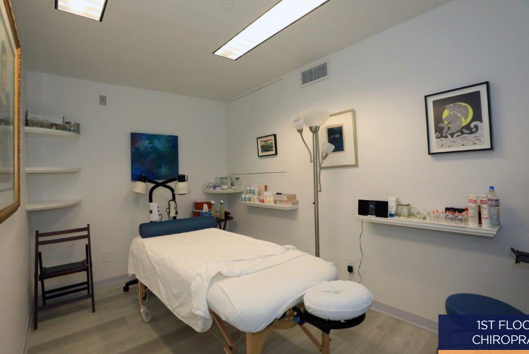
1ST FLOOR FORMER CHIROPRACTIC SUITE