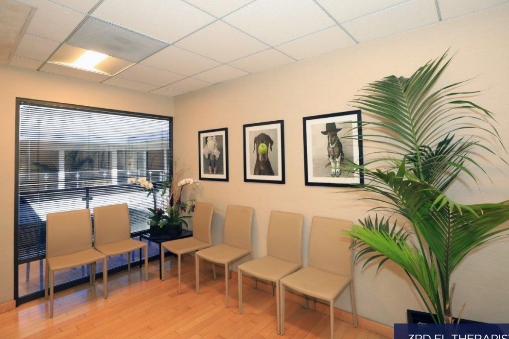
3RD FL THERAPIST EXECUTIVE SUITE