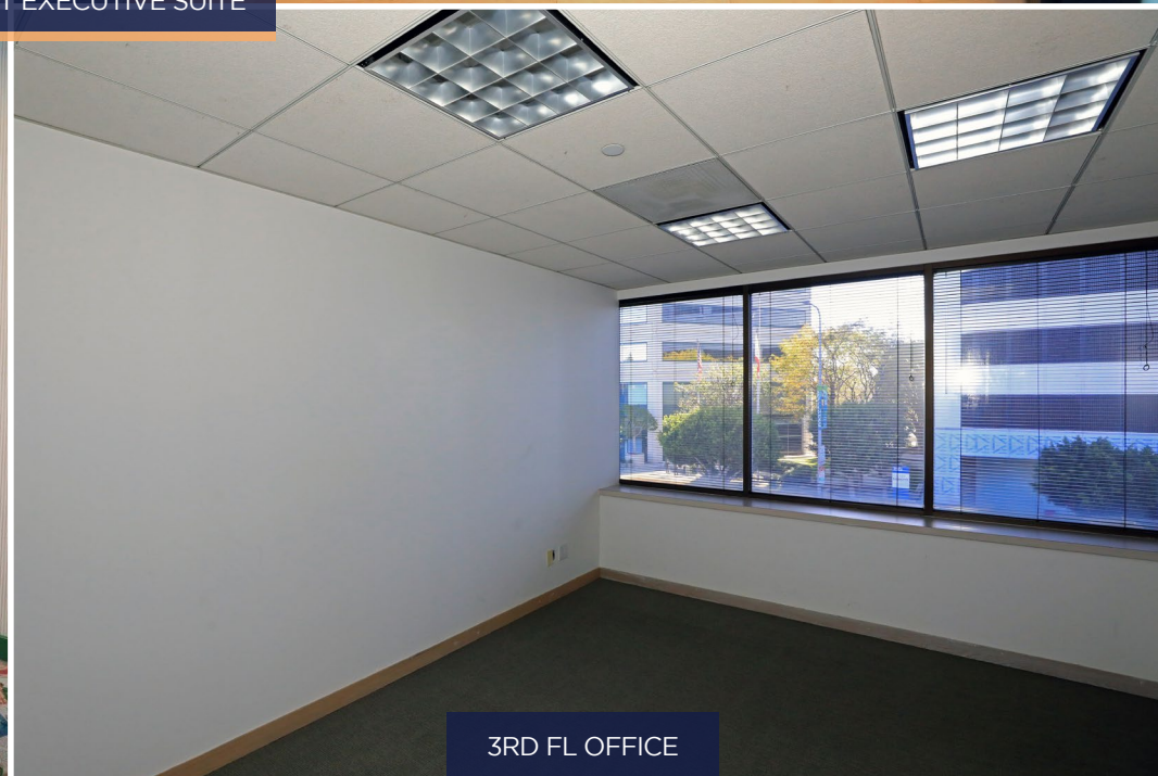
3RD FL OFFICE