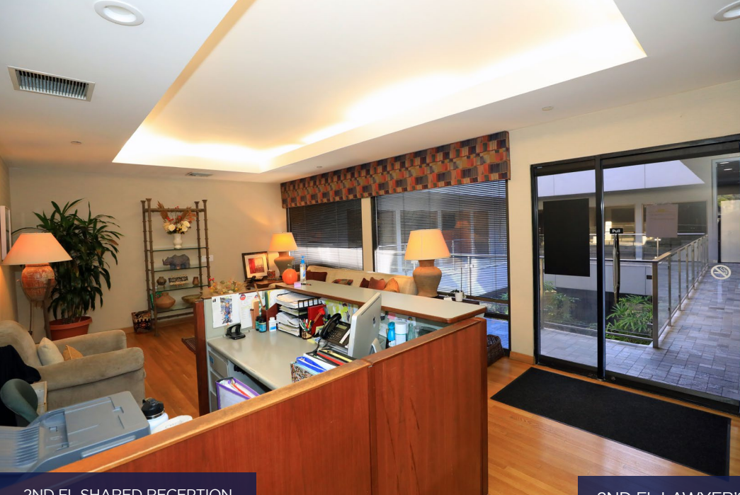
2ND FL SHARED RECEPTION