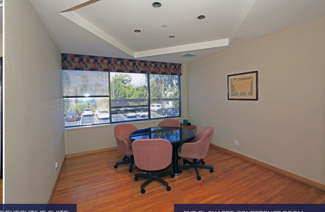
2ND FL LAWYER'S EXECUTIVE SUITE